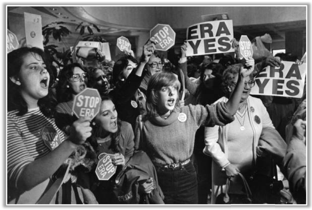
Pro and Con demonstrators try to outshout each other in the legislative halls - Tallahassee, Florida. January 18, 1982