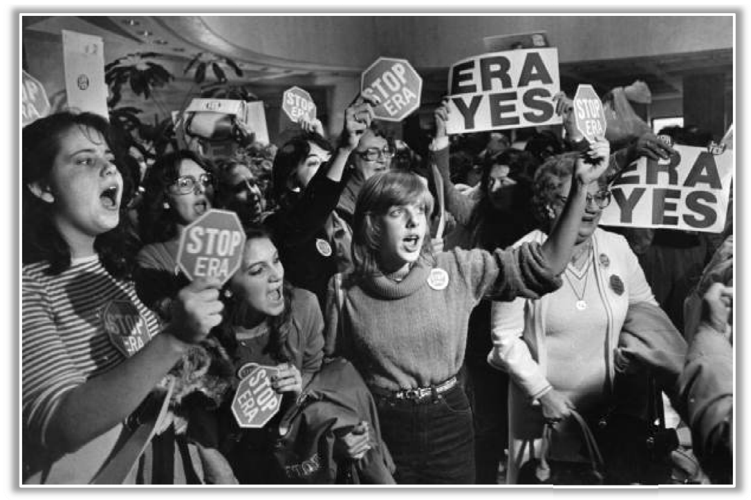
Pro and Con demonstrators try to outshout each other in the legislative halls - Tallahassee, Florida. January 18, 1982

The Florida Legislature has tried to pass the Equal Rights Amendment three times since 1972. The Florida House of Representatives approved it all three times. But each time, the Florida Senate rejected it. The last time the House passed it, the vote was much closer than the first time. With the 1982 deadline here, no one can guess how either chamber will vote. This will be Florida's last chance to ratify the amendment. Only three more states are needed for ratification. If Florida votes for it, many believe that at least two more states will follow in their footsteps before the deadline.