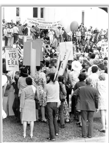
Pro-ERA demonstration on Historic Capitol Steps (1982)