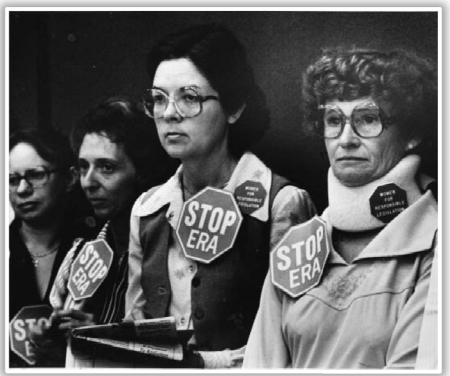
Anti-ERA women line the wall of Senate committee room (1979)