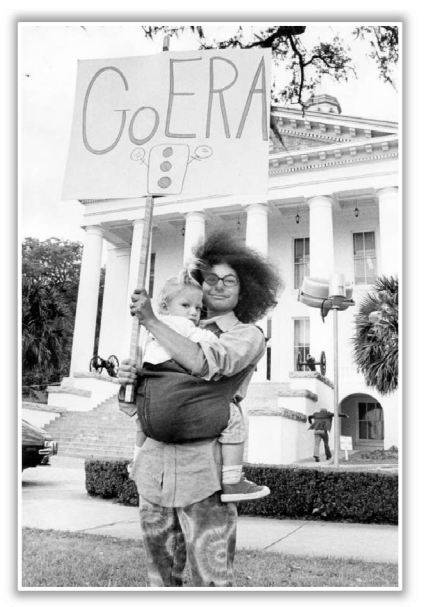
Protestor in front of the (Historic) Capitol (1973)