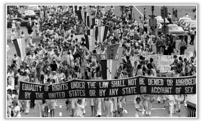
Supporters of the Equal Rights Amendment march down Pennsylvania Avenue Aug. 26, 1977