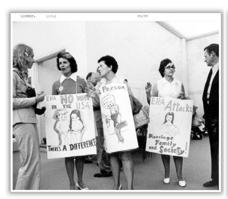
Three Anti-ERA protestors in the Legislative halls (1975)