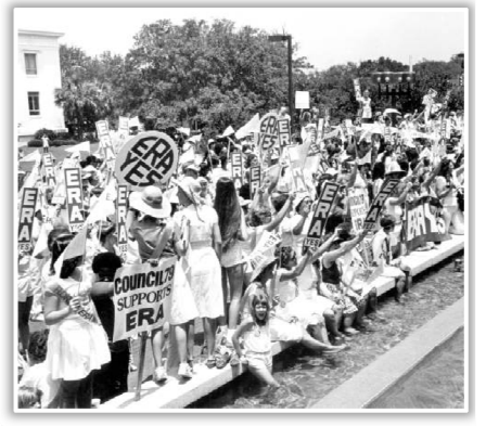
Pro-ERA protests (1982)

1. Join the protestors! Design your own sign below, stating if you're in favor or against the ERA. Please be as clever or creative as you can with your sign!