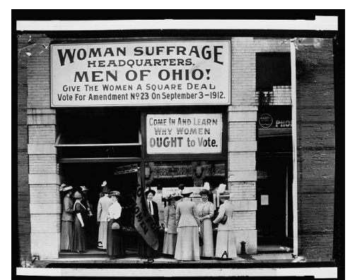
Women suffrage headquarters: Cleveland, Ohio, 1912

You get to decide if Florida should ratify the Equal Rights Amendment (ERA). The ERA would guarantee men and women equal rights. Thirty-five states have already ratified the amendment. If Florida does too, it would set the stage for it to be added to the U.S. Constitution.