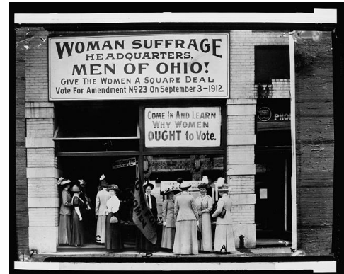
Women suffrage headquarters: Cleveland, Ohio, 1912

What right did the 19 th Amendment guarantee American women?