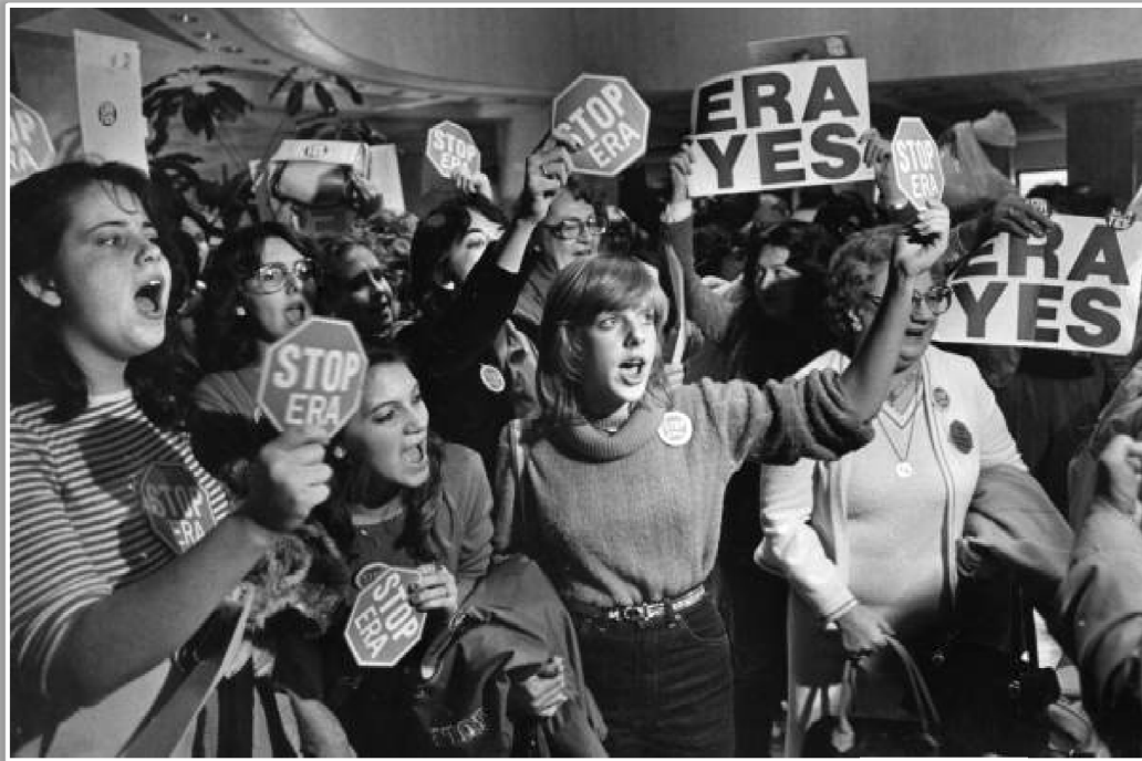
Pro and Con demonstrators try to outshout each other in the legislative halls - Tallahassee, Florida. January 18, 1982